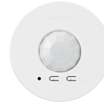
Ceiling Mount Occupancy Sensor