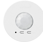
Ceiling Mount Occupancy Sensor