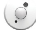
Ceiling Mount Occupancy/Daylight Sensor